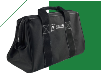
Soft-Sided Carry Bag