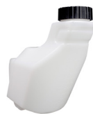
VP30 33.8 oz. Tank with Cap