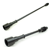
VP72 / VP74 Extension Wand 12" or 24"