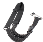
VP91 Carry Strap